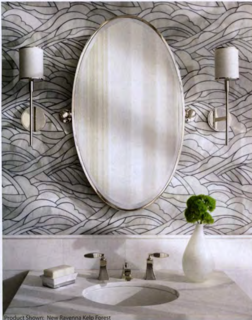
Product Shown: New Ravenna Kelp Forest