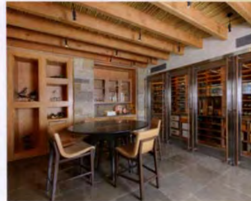
This contemporary reach-in wine cellar holds 668 bottles and combines Revel's wine wheels, sliding pullouts and case storage in a modern home built by Scott Christopher Homes.

pends on the needs of the client. "There are a lot of options for depth and width," he explains.